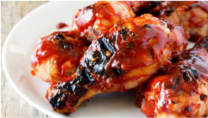
BBQ Chicken Drumsticks with Mashed Potatoes and Corn Nibbets

We are wrapping up the school year with a special treat. Our year-end specials include a gluten-free chocolate pudding!