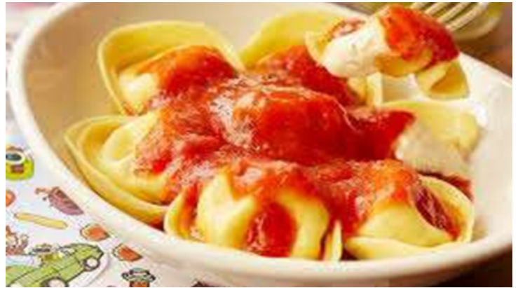
Cheese Tortellini in Tomato Sauce

Also available in June: Beef or Bean Soft Taco (can be ordered as an entrée only or as a combo with a fruit)